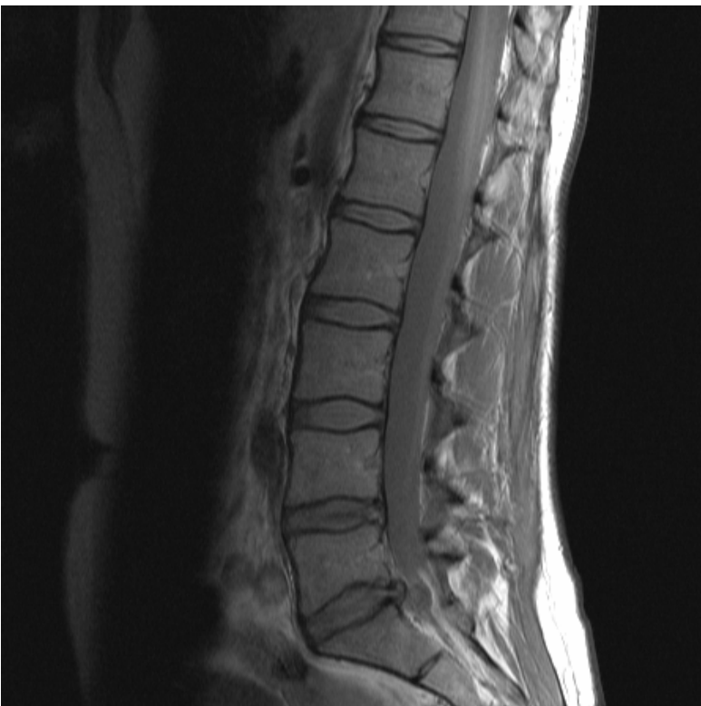
Figure 1. On this T2 weighted sagittal image, note the large free fragment of L5-S1 nuclear material lying within the vertebral canal and extending posteriorly to the lamina-spinous process junction.

No x-rays were taken. However, lumbar MRI was taken on 09-07-06. The report stated "medium sized, left sided central disc protrusion noted at L5-S1. There is a large disc extrusion at L5-S1 into the left lateral recess. Disc bulging at L4-5 and central canal stenosis at L5-S1". Study the following MRI study and the read of each. This is a very large free fragment.